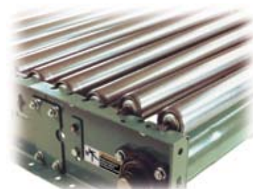
POP-OUT ROLLERS (some rollers raised for clarity)

ELECTRICAL CONTROLS: Magnetic starter (one direction or reversible); One direction manual starter; Momentary start/stop push button station; Forward/reversing /stop push button station. Mounting and pre-wiring for units up to 12' long.