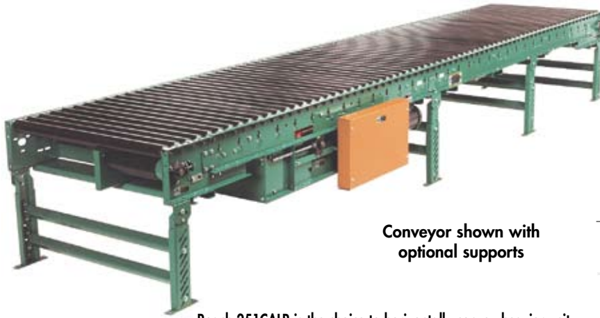
Conveyor shown with optional supports

24 HOUR SHIPMENTS INCLUDE ALL 1-FOOT INCREMENTS 6'-0" TO 100'-0"