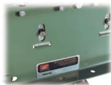
CALR CAM AND SERIAL PLATE