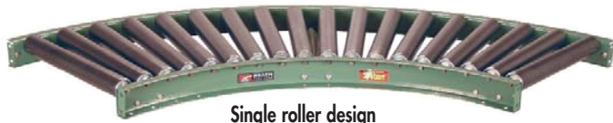
Single roller design