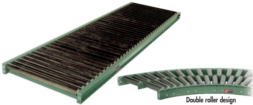
Double roller design

24 HOUR SHIPMENTS INCLUDE ALL 1-FOOT INCREMENTS 1'-0" TO 10'-0" ON STRAIGHT SECTIONS